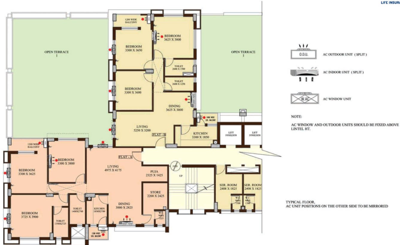
DIAGRAM SHOWING SUGGESTED LOCATIONS OF AIR CONDITIONING UNIT TO MAINTAIN BUILDING ELEVATION