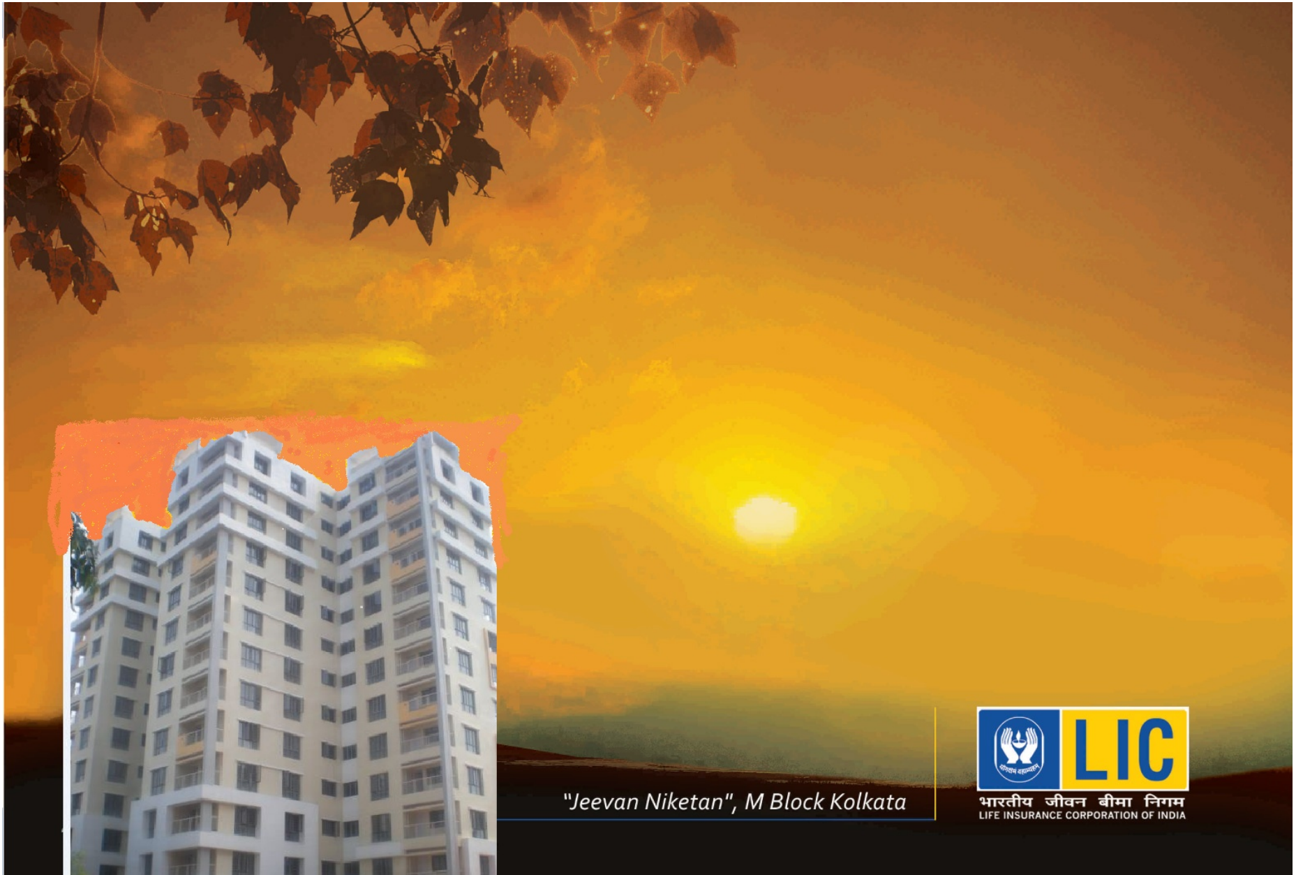
"Jeevan Niketan", M Block Kolkata