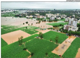
UNDERWATER CITY: The Nagala Park area in Kolhapur

Sandip Dighe & Abhijeet Patil TNN Pune/Kolhapur: The Panachanga and Krishna rivers in Kolhapur and Sangli respectively rose dangerously on Friday posing a flood-like situation. Panachanga River flowed above the dam level nearly 40ft at Rajaram Barrage in Kolhapur on Friday night with a discharge of 100 m³ per second.