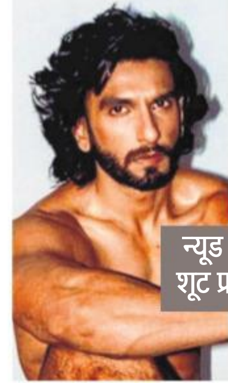
न्यूड फोटो शूट प्रकरण

प्रतिनिधी/मुंबई : न्यूड फोटो शूटप्रकरण बॉलिवूड अभिनेता रणवीर सिंगला चौकशीसाठी हजार राहण्यासाठी समन्स बजाविण्यासाठी चेंबूर पोलिसांचे एक विशेष पथक त्याच्या घरी गेले होते; मात्र रणवीर घरी नसल्याने पोलिस पथक पुन्हा समन्स बजाविण्यासाठी जाणार आहे. लवकरच त्याची पोलिसांकडून चौकशी करून जबाब नोंदविण्यात येणार आहे.